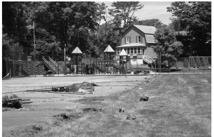
Tennis Courts Before

It appears Dix Park maybe be one of the oldest playgrounds in Beverly. Thanks to the forward thinking ideas of its residents as well as their generous contributions, a vital meeting place was established for everyone’s enjoyment. It seems appropriate we all continue the legacy.