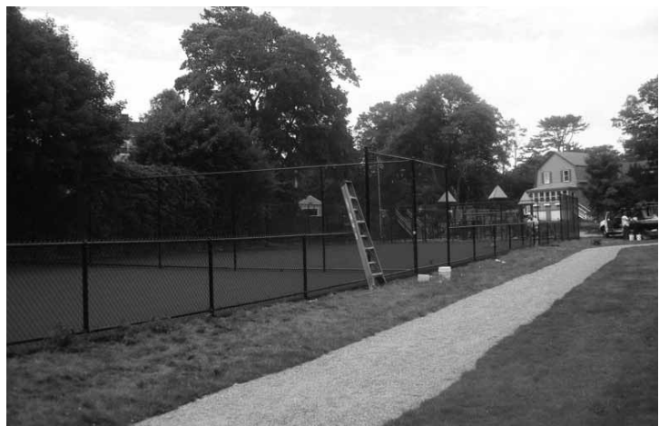
Tennis Courts Now