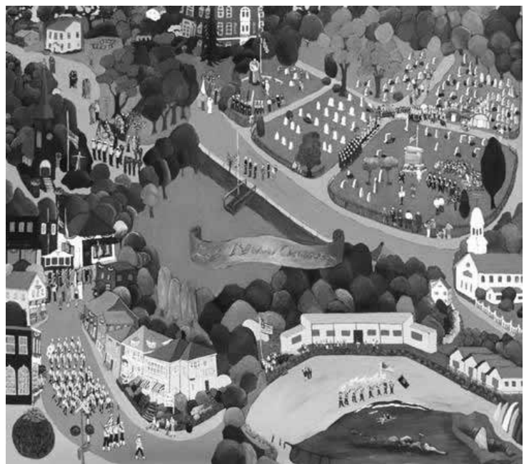
"Every Memorial Day"