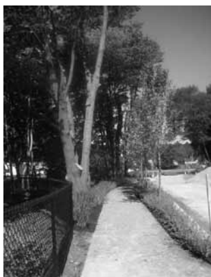
Newly installed pathway, planting and trees along Dix Way