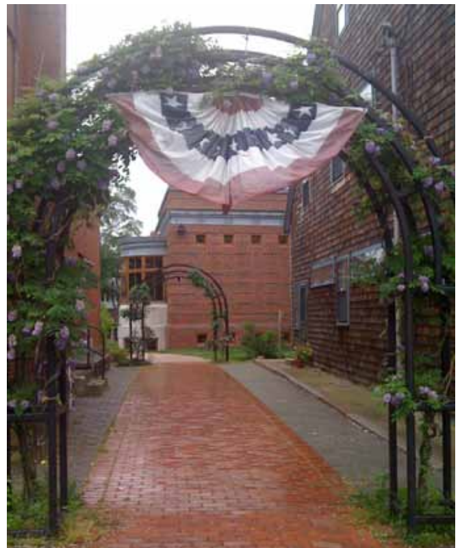
iron arches, brick pathway and wisteria installed by BFIS