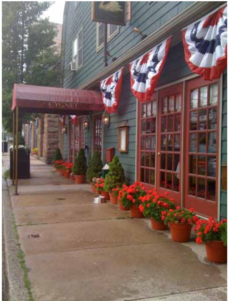
Cygnets in Bloom

Sharon Champagne's Salon and Day Spa: One Stop for Summer Pampering. With summertime upon us, now is the time to treat yourself to summer highlights and pretty nails.