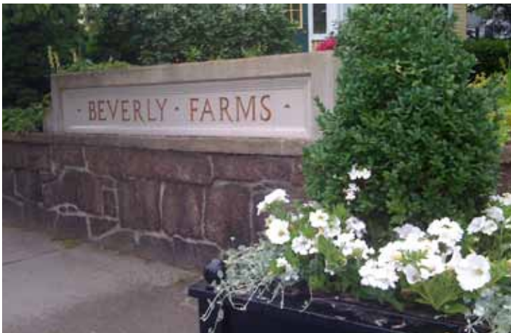
signage and flowers installed by BFIS