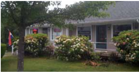
QG Elite - 15 Oak Street